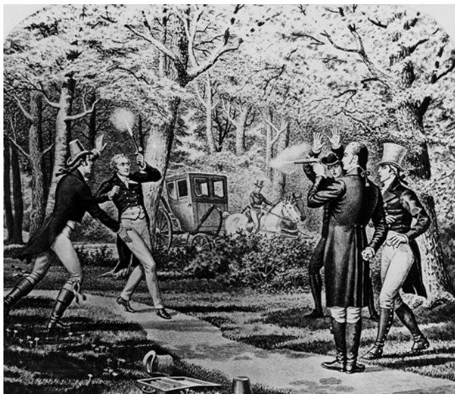
4. The heated political rivalry between Aaron Burr and Alexander Hamilton ended in a duel at Weehawken, New Jersey, on July 11, 1804.

Fourth, in 1800 the incumbent president lost the election and eventually conceded, though it would have been possible for him to stay in power through manipulating the House of Representatives. When Adams voluntarily turned over the power of the presidency to Jefferson, the legitimacy of the new nation's political system was assured; and the role that parties were to play in that system demonstrated a primacy without precedent.