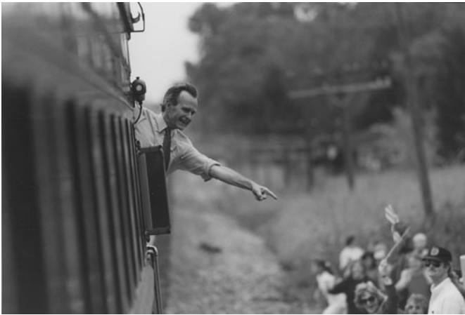
9. President George H. W. Bush waves from the back of the train outside Bowling Green on a whistle-stop campaign trip through Ohio in September 1992.