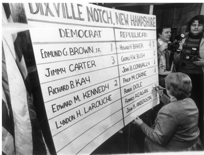
8. Officials tally votes at the presidential primary in Dixville Notch, New Hampshire, traditionally the first town in the state to report its results.

caucuses have opened the official nominating season. Leading candidates tend to concentrate on these contests, giving those states significant influence, many argue too much influence for states that are unrepresentative of the nation as a whole or of the supporters of either party. 11 States, either acting on their own or in consort with other states from their same region, have moved their primary or caucus dates to early in the process in order to increase the attention paid to their contests. As a result, the entire nominating process is “front-loaded.” In 2004 more than three-quarters of the delegates were chosen by April 1, four months before the convention. As a result, Senator John Kerry had amassed enough pledged delegates to assure himself the nomination by March 13. 12 Therefore, citizens in states holding primaries after that date had absolutely no influence on whom their party would nominate. 13